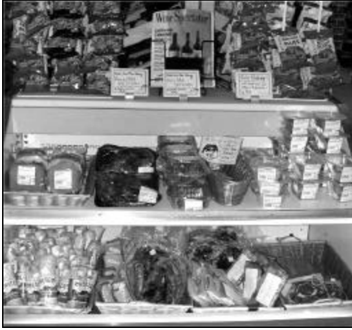
The grab-and-go case is always filled with sandwiches and deli selections.

Have you seen our new salad bar? In addition to fresh organic greens, we offer various types of bean salads and other tasty accoutrements.