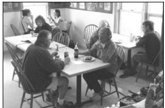
The Putney Co-op Deli offers delicious hot and cold lunches seven days a week.

Come by for an eat-in lunch, or grab a wrap to take with you. You'll find good food and good service.