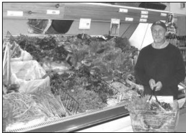
The Co-op offers fresh local produce at farm stand prices.

In addition to meat, fruit, and vegetables, we also carry local dairy products such as eggs and cheese, baked goods, gourmet mustard, and maple syrup.